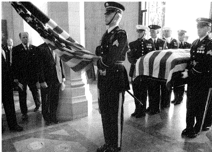
An honor guard and pallbearers accompany the casket of former President Gerald Ford at the start of the Jan. 2 state funeral held at Washington National Cathedral.